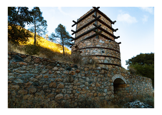
"Calera" is Spanish for Lime Kiln